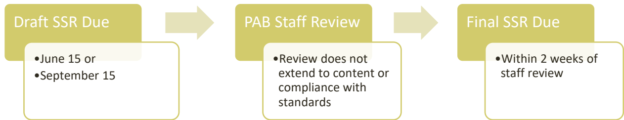
Figure 2: SSR Submission Process